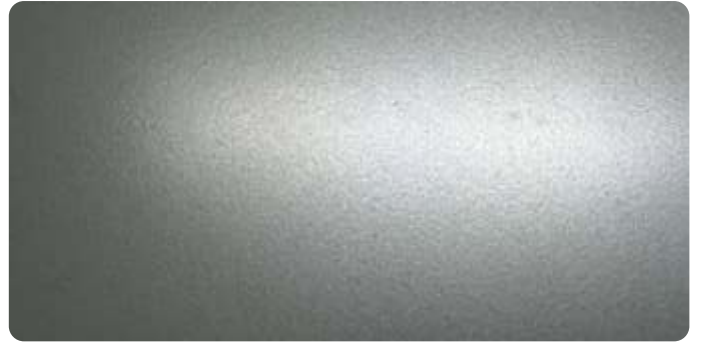
Stainless Steel C31