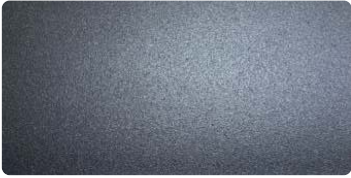
Gris 2900 Sable