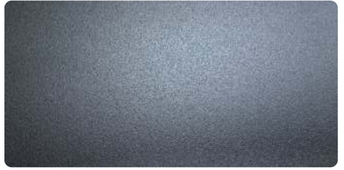
RAL 7022 FT