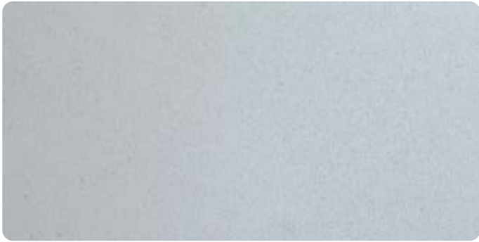
RAL 9016 FT