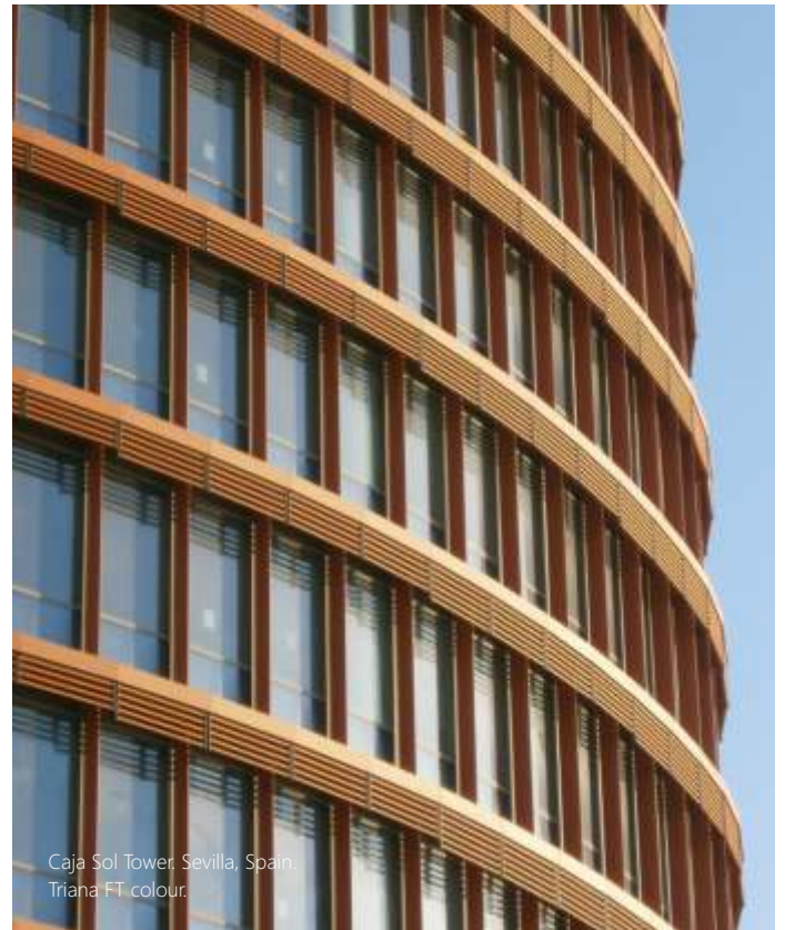
Caja Sol Tower, Sevilla, Spain. Triana FT colour.