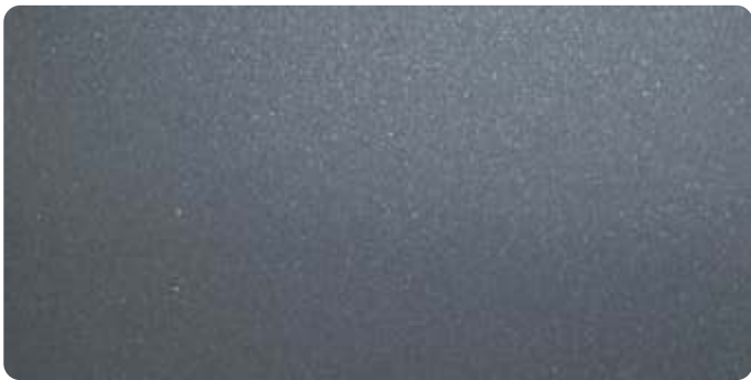
RAL 9007 FT