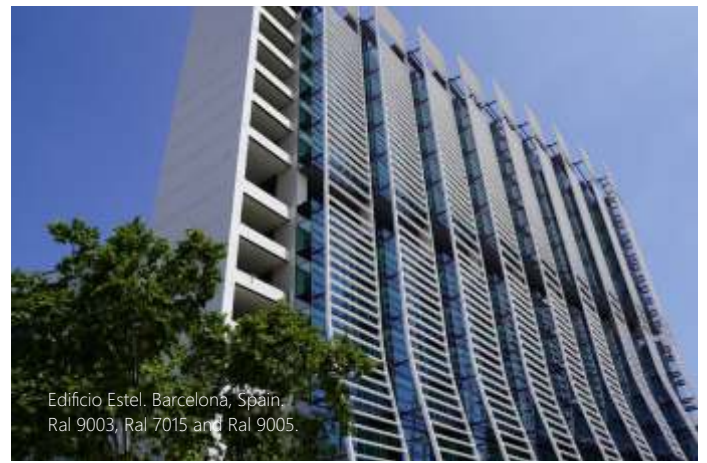
Edificio Estel, Barcelona, Spain. Ral 9003, Ral 7015 and Ral 9005.