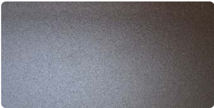
RAL 8014 FT