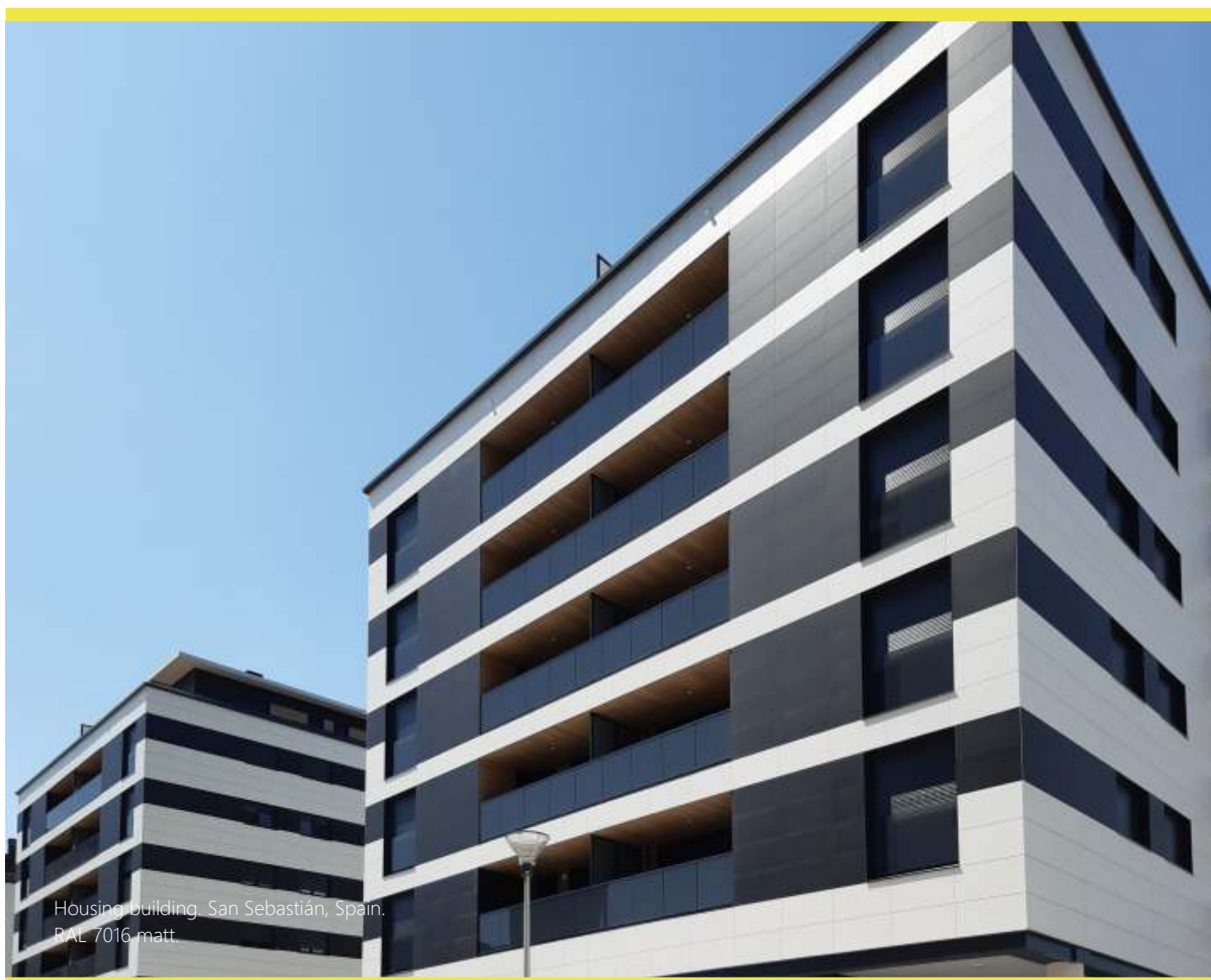
Housing building. San Sebastián, Spain. RAL 7016 matt.