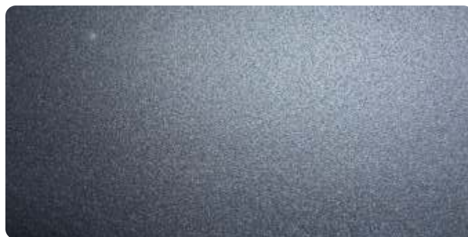
Noir 2100 Sable