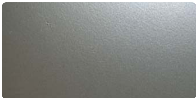
RAL 1035 Mate