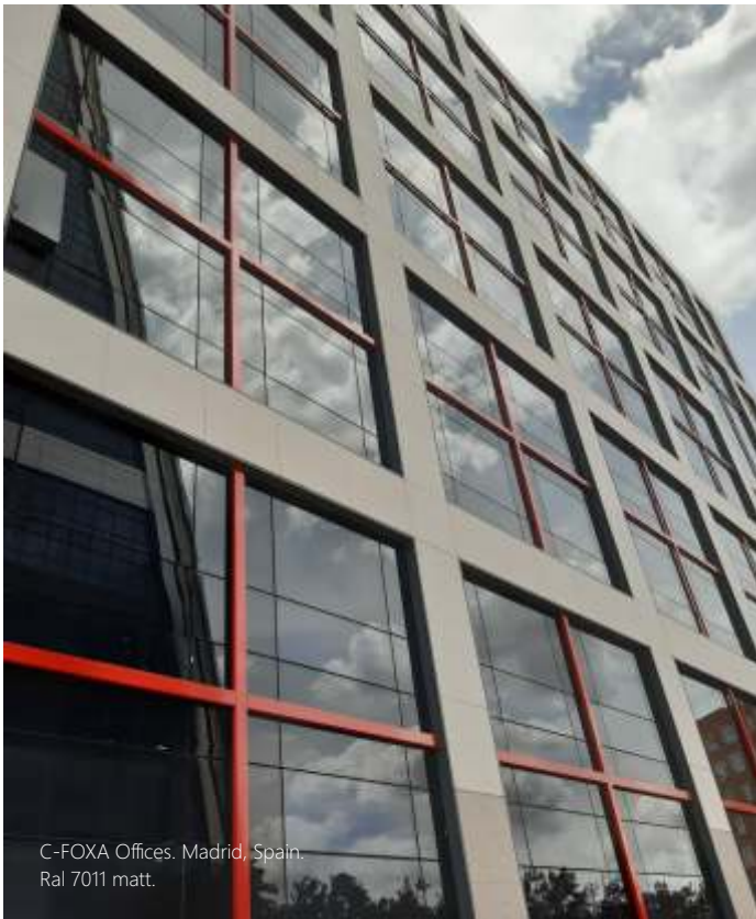
C-FOXA Offices, Madrid, Spain. Ral 7011 matt.