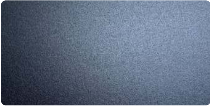
RAL 9005 FT