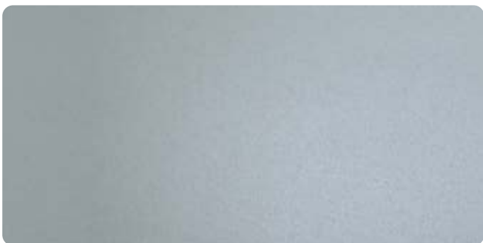
RAL 7035 FT