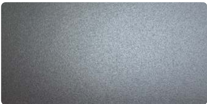
RAL 8019 Sable