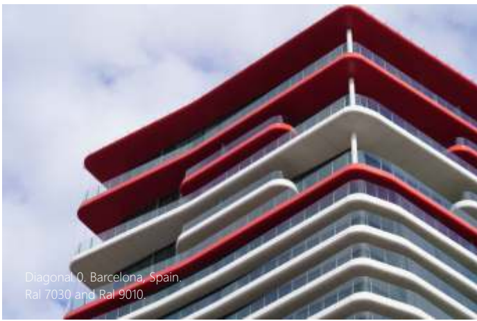
Diagonal 0, Barcelona, Spain. Ral 7030 and Ral 9010.